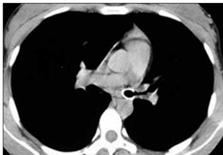
Figure 3. Postoperative multislice computed tomography image of the chest shows complete inflation of the stent.

complications, such as airway bleeding, choking, airway wall rupture, or pneumothorax, occurred. After airway stenting, dyspnea was immediately alleviated, cyanosis and retraction sign of three fossae disappeared, and the patients were able to breathe in the supine position or even get out of bed. Patients experienced some discomfort after airway stenting, such as varying degrees of retrosternal pain, coughing, expectoration, and blood-stained sputum. All patients received symptomatic treatment with anti-inflammatory and expectorant drugs and aerosol inhalation, which gradually lessened or relieved the above symptoms over 3–7 days. Further treatment was administered according to the pathological examination results of the biopsy specimens. The biopsy results revealed squamous cell carcinoma (n=19), lung adenocarcinoma (n=2), tracheal ade-